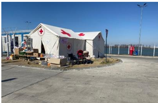
Isaccea-Orlivka Border crossing, March 2022.

Regarding refugees for example, the armed conflict in Ukraine makes the People's Advocate of Romania conduct investigations to assess the situation at the border crossing. Several colleagues visited the crossing point for Ukrainian refugees to evaluate the entire process. They focused particularly on how state authorities were operating. At the border crossing points, many organisations were active. There was a very good collaboration on the ground, both of the competent public institutions and authorities, as well as of the private and non-governmental sector. Additionally, they intervened with the central administration to advocate for better support for the volunteers working at the border, including measures such as compensation, paid time off, or replacement support.