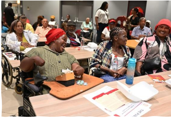
Stakeholder engagement with people living with disabilities in Cape Town.