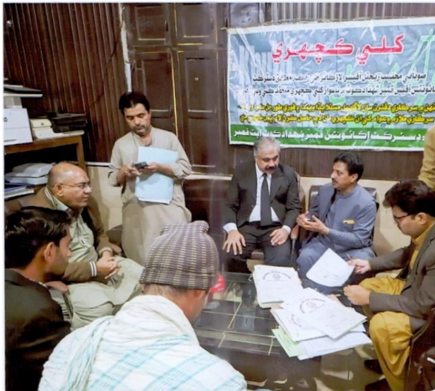
Open house meeting of Regional Director Larkana with general public.

At present the Ombudsman office Sindh uses beside social media, website, workshops and seminars, open house meetings to disseminate information regarding the work of their office. Besides that, the Ombudsman Sindh also established regional offices at district level of the province, covering far-flung areas. The concerned regional directors hold public meetings, site visits and communicate with society through NGO's, seminars and other such awareness activities.