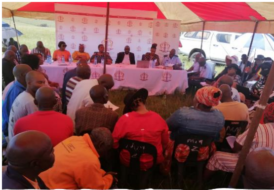
Stakeholder engagement with the rural communities in Limpopo and Eastern Cape Provinces.