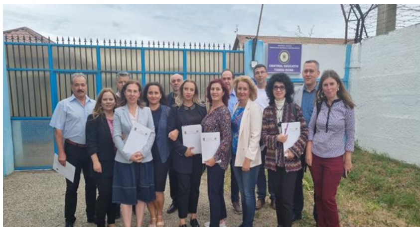
July 13, 2022 – Strengthening the monitoring skills of NPM Romania by conducting a practical visit to the Târgu-Ocna Educational Center, Bacău County, Slănic Moldova.

torture and cruel, inhuman or degrading punishments or treatments. This is done in addition to the (unannounced) visits made in places of detention (penitentiaries, detention centres and pre-trial detention, etc.), and formulating recommendations to the management of the places visited. The People's Advocate Institution of Romania does not consider these activities as outreach, since it acts according to their NPM mandate. However, according to the institution, these activities are the closest to the meaning of outreach in their work.