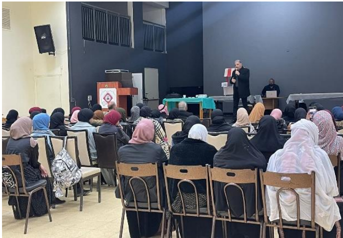
Outreach activity for the Bedouin community.