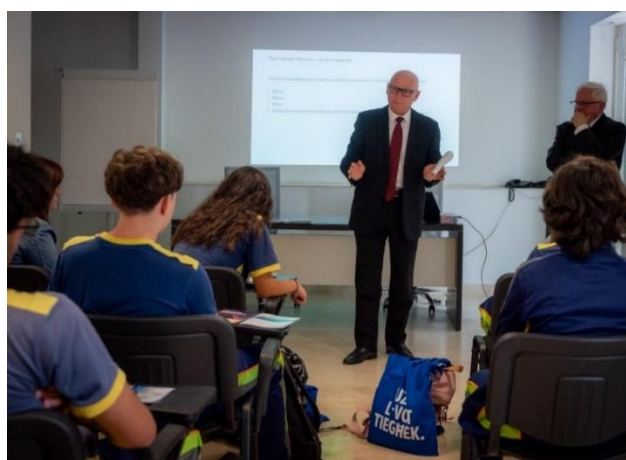
The Parliamentary Ombudsman of Malta, Judge Joseph Zammit McKeon, meeting students during Freshers' Week.