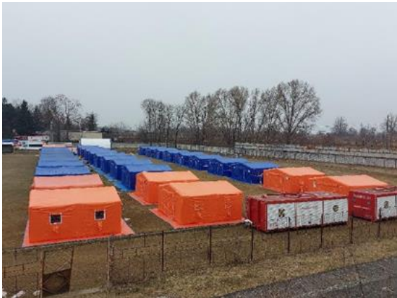
Accommodation spaces Isaccea-Orlivka Border crossing, March 2022.