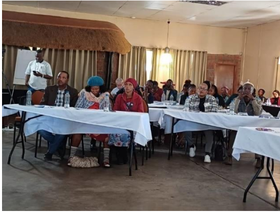
Chiefs of the Rundu & Otjiwarango offices of the Ombudsman of Namibia, participated in stakeholder engagement workshops on indigenous voices, pathways to a sustainable future at Otjiwarango.