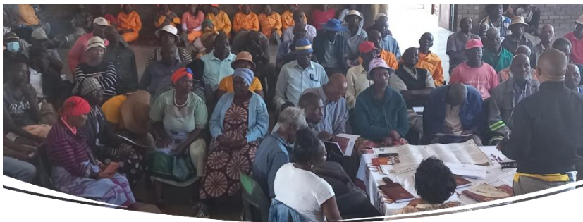
Stakeholder engagement with the elderly in Limpopo Province.