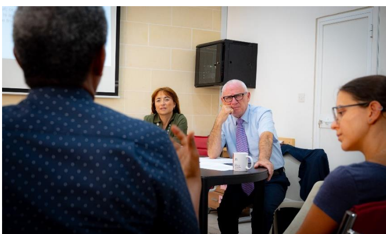
The Parliamentary Ombudsman of Malta, Judge Joseph Zammit McKeon, during a meeting with refugees.

The Ombudsman of Malta also met with ambassadors accredited to Malta, representing communities with significant populations in the country. These discussions emphasised the office's commitment to ensuring its services are accessible. Not only to Maltese and European nationals, but also people from other countries, reflecting an inclusive approach to upholding fairness and justice. The meetings with ambassadors provided opportunities to raise awareness about the Ombudsman's responsibilities while strengthening relationships with stakeholders to promote a more transparent and accountable public service. By addressing concerns directly and fostering trust, the office of the Ombudsman of Malta continues to position itself as a key advocate for equity and good governance.