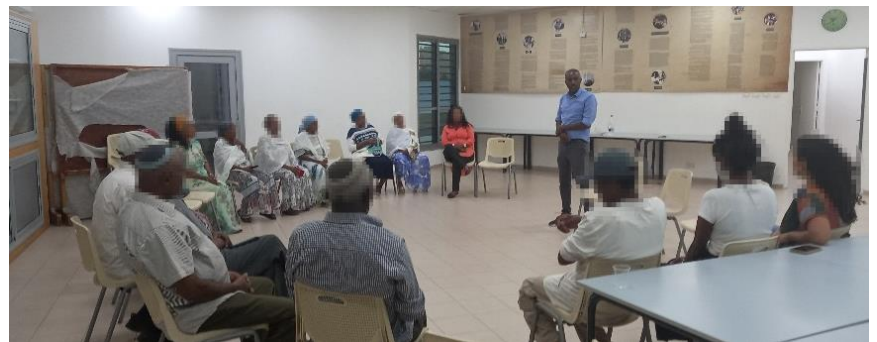
Outreach activity for the community of Jews of Ethiopian origin.