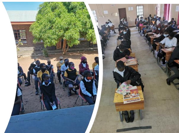
Stakeholder engagement with youth / scholars in Eastern Cape and Limpopo Provinces.