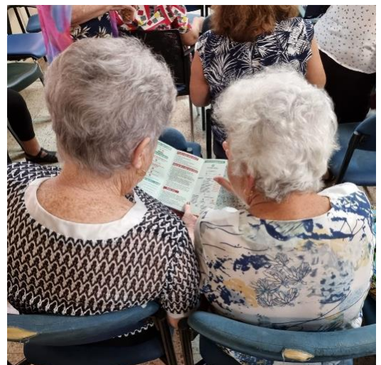
Outreach activity for older persons.