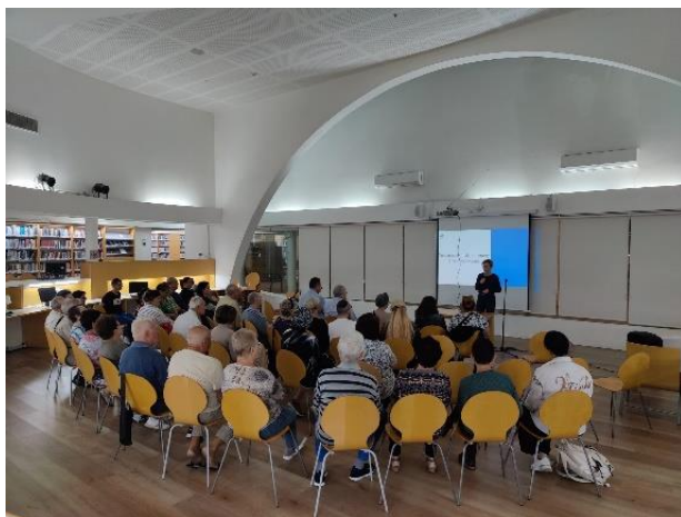
Outreach activity for Ukrainian refugees.