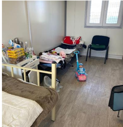
Siret-Porubne Border Crossing, March 2022.