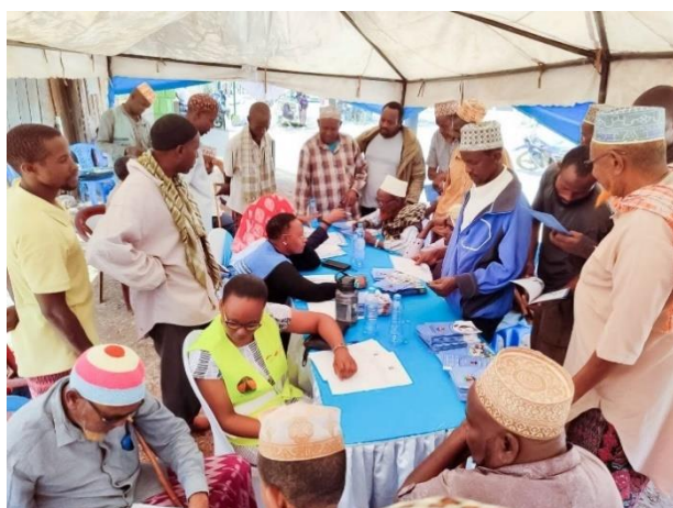
Awareness campaign of the Ombudsman of Kenya.

According to the office of the Ombudsman of Kenya, collaborating with NGO's and civil society groups not only allows the office to extend its reach and engage with communities more effectively, but these partnerships also focus on joint advocacy, awareness campaigns, and capacity-building initiatives.