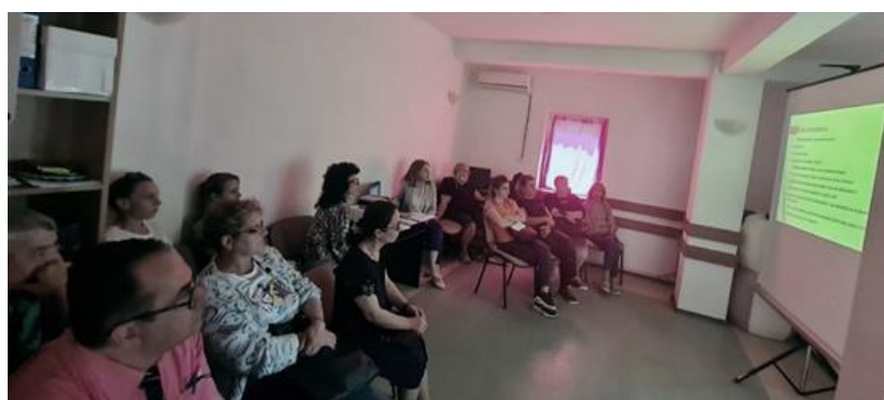
May 22, 2022 - NPM Romania conducts a training activity for the staff of the Artemia Techirghiol Neuropsychiatric Recovery and Rehabilitation Center